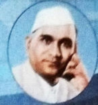
Karmaveer Bhausaheb Hiray