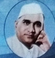
Karmaveer Bhausaheb Hiray