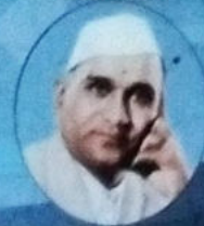
Karmaveer Bhausaheb Hiray