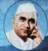
Karmaveer Bhausaheb Hiray